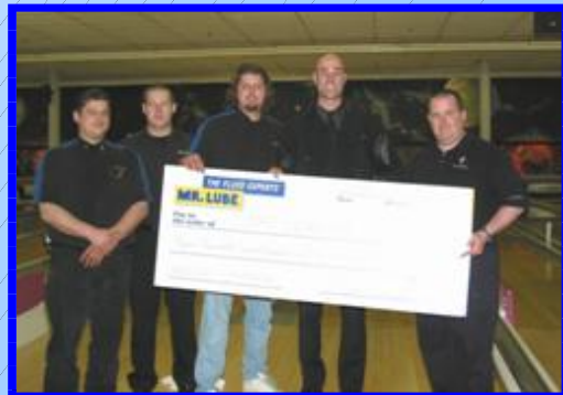
Mr. Lube's Donation to CQEO